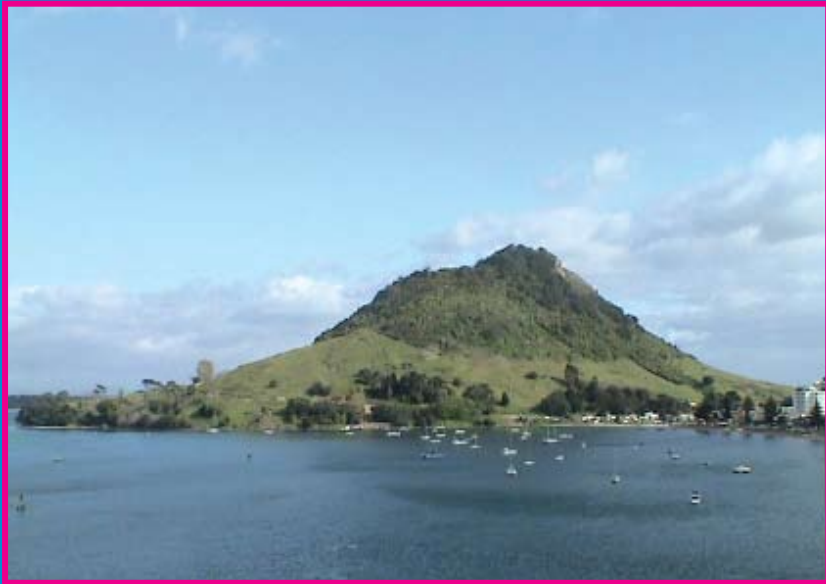
Mount Maunganui, New Zealand

"Promoting a Lifestyle Free of Alcohol and other Drugs"